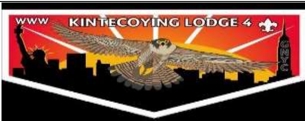
The First Flap of Kintecoying Lodge #4