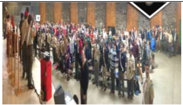
Charter Members of Kintecoying saying the obligation

The very first duty of the officers was the unveiling of the new lodge flap. A contest was held for any youth member of the lodge to submit a design. The first flaps were sold and all current dues paid members are able to buy a flap that has embroidered on it "Charter Member". Then the new lodge membership cards were given out. All dues paid brothers for 2013 have on their membership cards the words 'Charter Member'. A nice touch and a collector's item! How long till we see these on Ebay? At this point, all the brother said the obligation as Kintecoying members and joined together to sing the OA song.